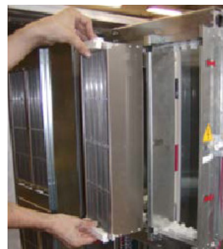
Front withdrawal version

Crystall filters are available in a number of different configurations and offer an efficient alternative to bag filters especially when re-furbishing air handling equipment.