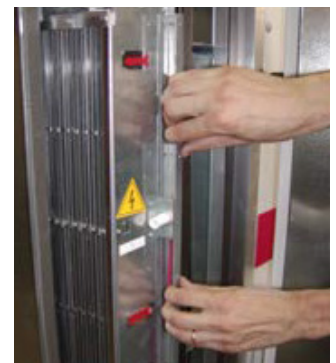
Side withdrawal version

The electrostatic filters consist of 2 main elements: